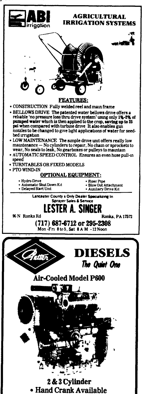
11½ To 40 H.P.