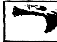
3 POINT SCRAPER