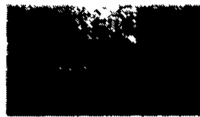
Hi-Cubes Chevy 12' & 14' Hi Cube Vans, Steel and Aluminum Grumman Olson, Union City American Cargo As Low As . . . $15,200