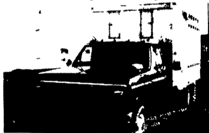
F350 Cattle Truck