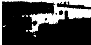
Medium Duties 1986 Chevy C-60 & C-70's In Stock, 23,000# 28,000# GVW