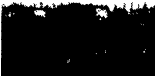
Big Dooley 4x4 1985 Chevy Silverado; 4x4 Big Dooley, Loaded With Options, Was $16,995. . . . Now $15,995