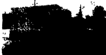
F350 Utility Truck