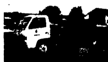
Isuzu C/C & Van Bodies

No One Will Sell You A New Truck For Less!