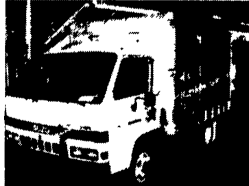
Isuzu Cattle Truck