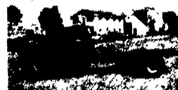
F350 C/C 137 & 161 In. WB Chassis