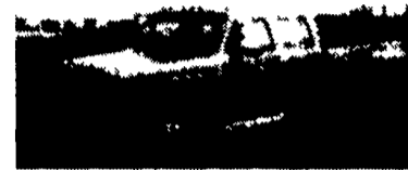
Big Dooley Crew Cab 1985 Chevy Crew Cab "Big Dooley" 7,000 Miles, Excellent Condition Now $17,495

PLUS 50 Chevy Pickups, 20 S10 Pickups, 15 Work Vans Small Dump Trucks And Our New Chevy Tiltmaster Series - All in Stock