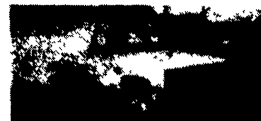
Cab & Chassis Chevy Cab & Chassis: 60 & 84 C A 454's, 10,000 & Up GVW