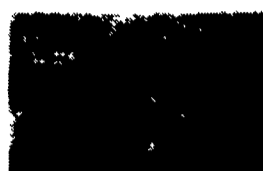
Step Vans Chevy 12' & 14' Step Vans Steel and Aluminum Grumman Olson, Union City, As Low As . . . $15,900