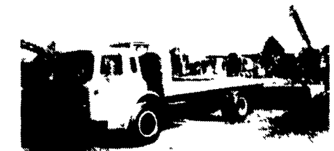
1971 IHC CO1800, V-8 Gas, 5x2, 9x20, P.S., 24' Henderson Roll Back, Hydraulic Winch $8,500