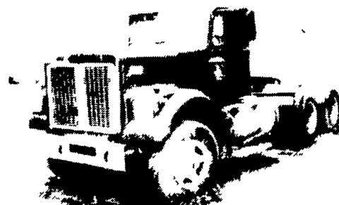
1974 WHITE Road Boss, 290 Cummins, 10 Speed, 10x20, 38R $4,500