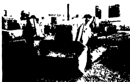
HITACHI TS15B Crawler/Loader Cat 977 Size $10,500