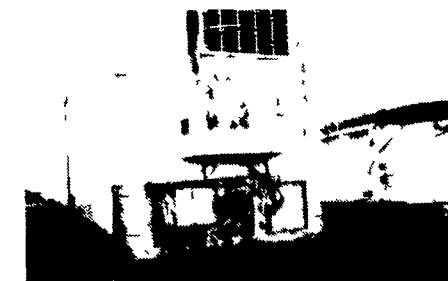
1971 FRUEHAUF 40' Refer, 13' High, Meat Rails, 10x22, Side Door $2,500