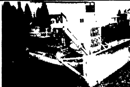
CAT D-6, UC 70%, Hydraulic Blade, $5,500