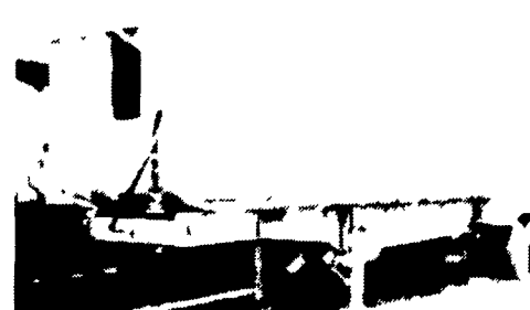
1974 FRUEHAUF 32' Alum Dump, 39" Sides $9,500