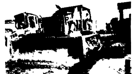
HD21B Fiat Allis Dozer Tilt Blade, Power Shift, ROPS Canopy $25,000 Also HD21B Fiat Allis Tilt Blade, Ripper, Full Cab $35,000 D9H Cat Dozer Tilt Blade, Ripper, Full Cab, SN#90V5728 $73,000 D6C, D6D, D7F, Cat Dozers with winches $38,500 - $42,500