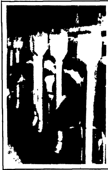
Simple ball valve in feeder means long, trouble-free service.

TWO TYPES OF FEED DELIVERY SYSTEMS (FLEX-AUGER or MULTIFLEX) AVAILABLE WITH THE NEW CHORE-TIME COW FEEDING SYSTEM