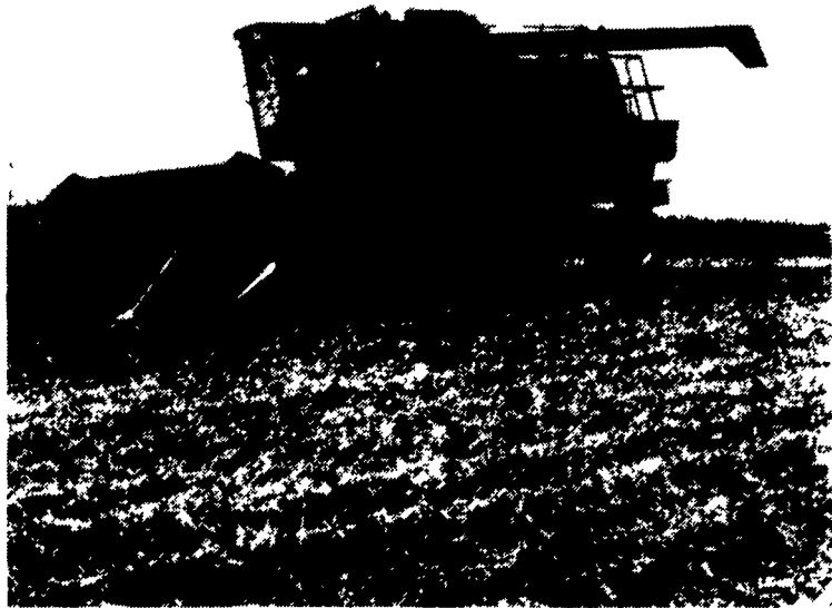
All new Case IH Axial-Flow combines, including the Model 1680 pictured, are now eligible for coverage under the J I Case Tailored Owner Protection System.

As with the new equipment plan, the used equipment coverage carries a $200 deductible for each repair order, including as many different repairs as necessary.