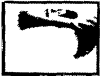
3 POINT SCRAPER