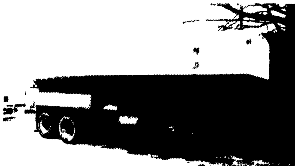
Sprout-Waldron Tandem Axle Bulk Feed Trailer With Self Contained Engine And Blower Equipment