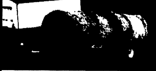
International 1190 Haybine

Speedy Wagon Round Bale Mover Also Vicon RS 510T Tedder Hay Buster 1068 No Til Grain Drill 215-944-0402