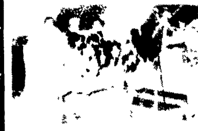
Rupp Vu Ultimate Minnie

An Ex-93 QUALITY ULTIMATE dau at 4-07 365d 2x 22,470m 3.8% 865f 1st 4 yr old Res Gr Champ All-Mich Show 1984, 1st 4 yr old & Best Udder, NY State Fair 1984, 1st 4 yr old Eastern States 1984