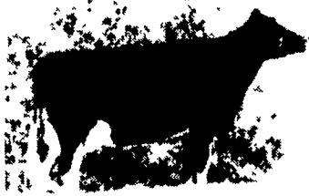
C. Raensons Majesty Leulla

A Tall Fancy 3 yr old CREEK dau, fresh, 2-03 365d 14,669m 3.7% 545f, 3/30/86 milk test wt= 80.2 lbs