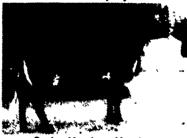
Spring Meadows March