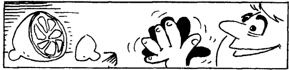
To remove fish odor from your hands, rub them with a thin slice of lemon.

To make lye using ashes, it is necessary to drip water through the ashes and collect it. The ashes from a winter's worth of wood burning should be sufficient. Using a large kettle or iron washpot, put in the lye water (about 1 gallon) and add 2 pounds of grease. Any fat can be used - bacon, beef, etc. - as long as it is melted and strained. Stir to combine and put on a fire. Stir until mixture becomes very thick. Pour into an enamel pan and allow to cool. Cut into bars. This recipe can be increased by increasing the amount of lye water and grease. CAUTION: Do Not Use Aluminum!