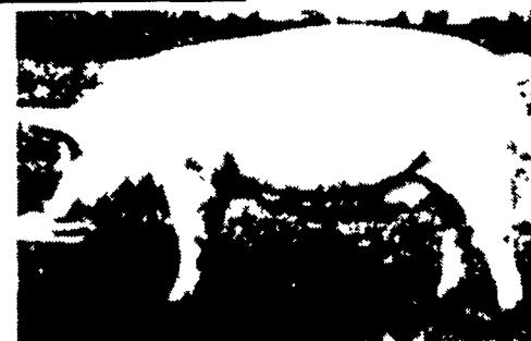
Pennsylvania's Record Selling State Sale Bred Gilt

Handmated - due June 25th thru early August. 30 Purebred & 45 Crossbred Gilts. Mostly sired by & carrying service to top test station boars.