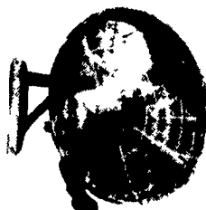
Belt Drive Panel Fan