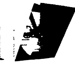
Wall Fan with Hood and Cabinet

All types of fans for all types of buildings. All belt driven fans come with ball bearing, high efficiency motors.