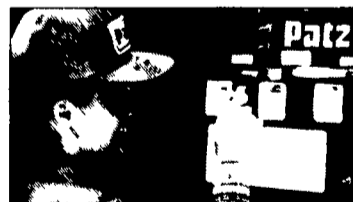
Patz gives you inside the barn comfort and fingertip ease of manure handling.