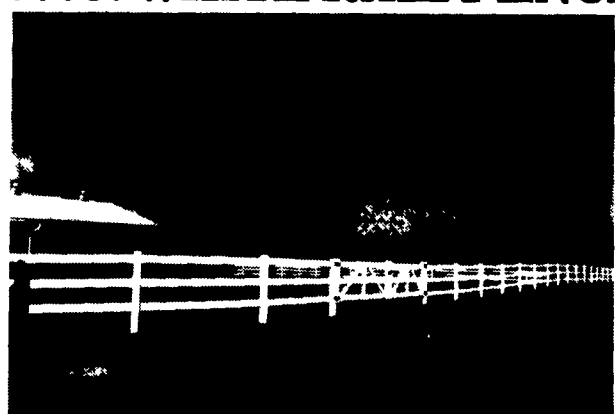
3-Rail Fence w/Gates "Never Need Paint" P.S. Polyvinyl will not rot, splinter, chip, etc.