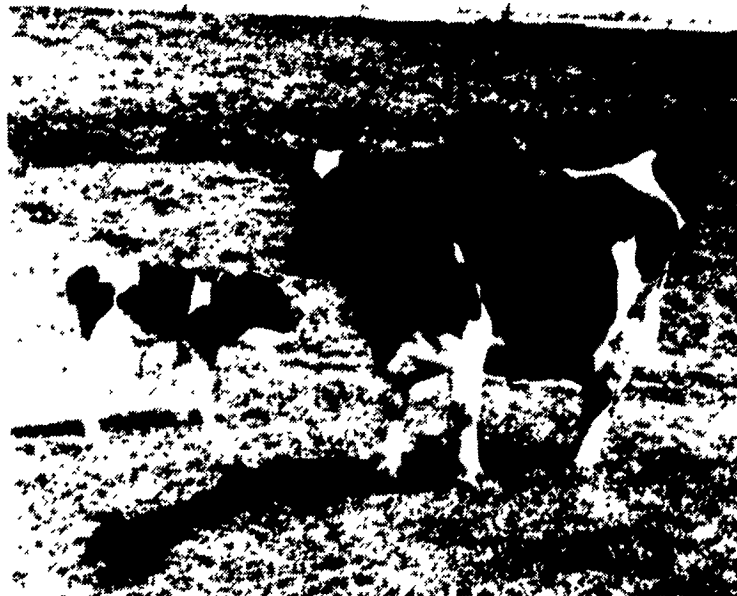
This mother seemed rather protective of her new baby when the cameraman wanted to take a picture. The day old baby was in the pasture along Starnner Road near Route 322. Their farm owner for religious reasons didn't want to be identified but said mother is a good milker along with her 39 other stable mates.