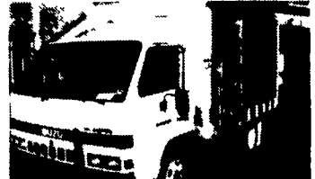
1986 Isuzu NDR, 4 Cyl., 5 Sp. Trans., PS, PB, Radial Tires, Tilt Wheel, Exhaust Brakes, Tilting, Cab, Turbo Diesel, 11,000 GVW, 11 Ft. Eby Cattle Body