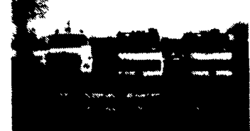
Good Selection of medium and heavy duty trucks