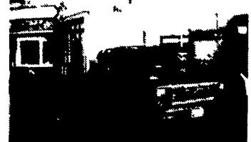
1986 Ford F350 Dual Rear Wheels, V8, 4 Sp. Trans., PS, PB, 11,000 GVW, 12 Ft. Eby Cattle Body