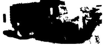
1972 IHC 1700 Gas V8, 5 Speed, Air Brakes, 26,000 GVW, Two Speed Rear, Runs Good, Ready To Work

No One Will Sell You A New Truck For Less!