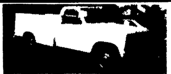
Ford F350 - Reading Utility Body