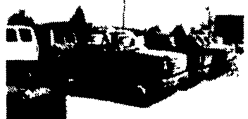
F350 C/C 161 & 137 in Wheel Bases