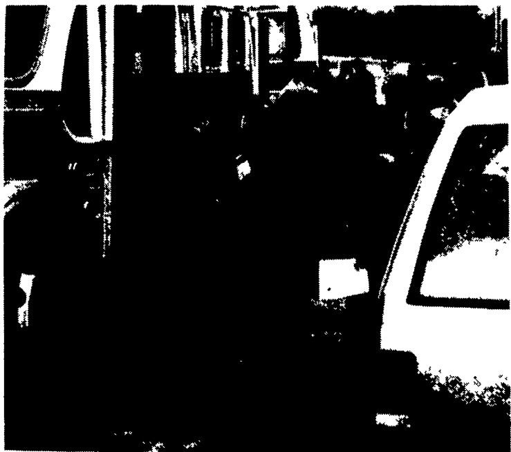
PFA members board bus for trip to the State Capital after briefing at Penn Harris Inn, Camp Hill.