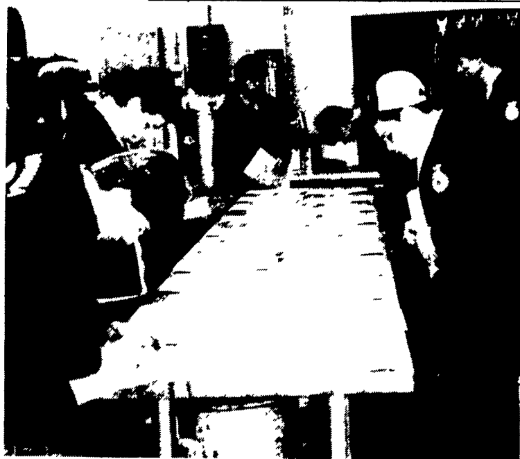
Scenes from Lancaster County FFA Agronomy contest held in the Vo-Ag department of the Ephrata High School. See story Page 1.