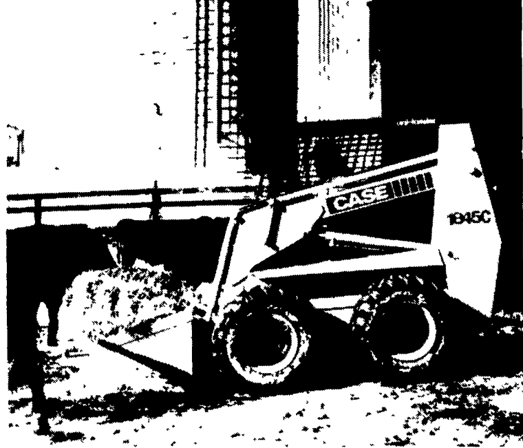
The Case Model 1845C is distinguished from its predecessor, the Model 1845B, by a new state-of-the-art Case diesel engine.

The new Case "control lock-out" system is a response to customer requests to the industry for additional safety features. After buckling himself into his seat, the operator must fold down the two short control levers in front of him. This prevents him from leaving the seat while in operation. If the "control lock-out" system is not engaged, the machine cannot operate.