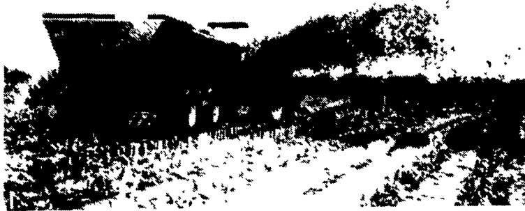
Gehl's 300-Series spreader features a square-tube auger that helps to move manure more smoothly, according to the manufacturer.

In addition to the 300 Series, Gehl's manure spreader line includes the 100 Series for solid manure; the 500 Series Slurry Special for semi-solid manure; and the 700 Series for liquid manure handling.