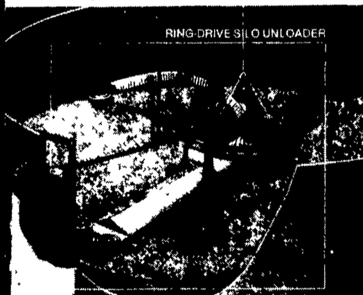
RING-DRIVE SILO UNLOADER

Rugged, tough, powerful! And P & D puts it all together for "total quality." Quality that means performance year after year. A pair of augers that rips into silage and delivers it to our "astro vented" rotor assembly where it's blasted into the chute. Your P & D silo unloader is built in a way that