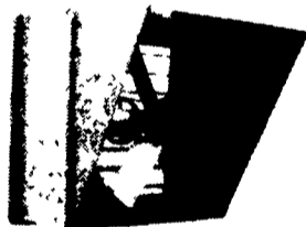
Wall Fan With Hood And Cabinet