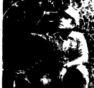
"good yields and fast

Hardy Brand Hybrid Corns have been scientifically bred for the Northeastern United States. They have proven their potential for high yields superior standability, and high tolerance to predominant disease on farms throughout our market area. Many of our customers have been using Hardy Brand for years for reasons like the ones above.