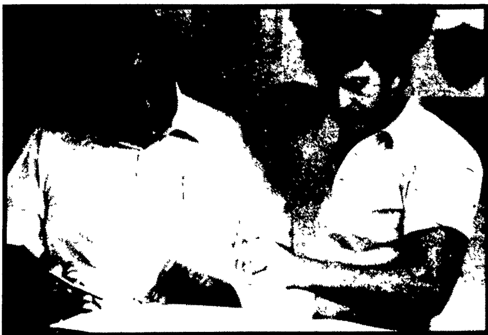
Records showing the true cost to produce 100 lbs. of milk or a bushel of corn are the basis for determining profitability.