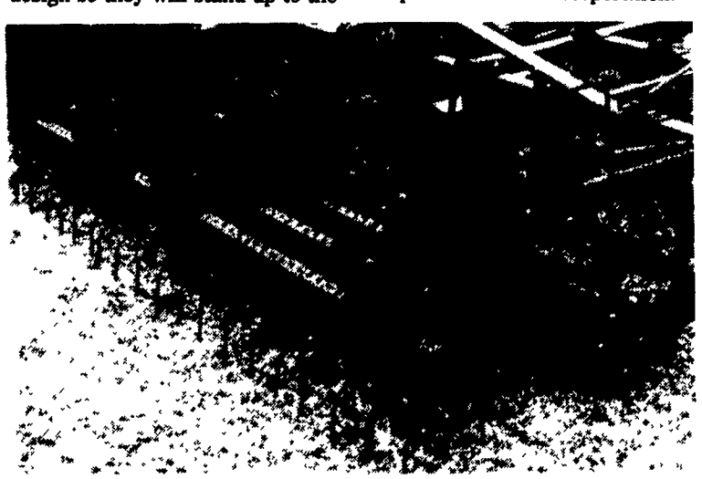
Hesston Corporation's single rolling basket/three coil tine harrow finishing attachment.

ther smooths the soil and mixes smaller clods with finer soil particles, also helping to insure complete chemical incorporation.