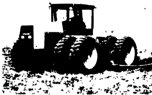
PUMA 1000 190 Horsepower

STEIGER POWER, COMFORT AND DEPENDABILITY AT A LOW PRICE AND WITH 5 YEAR NO RISK S.T.E.P. PROTECTION