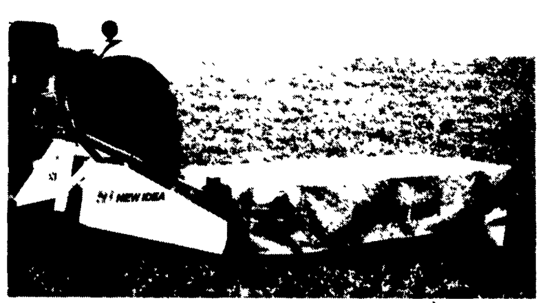
The Model 528 disc mower from New Idea.

One of the most advanced mowers available for the American farmer, New Idea's 520 Series Disc Mowers provide high capacity mowing in all hay crops including Timothy, Bermuda, Bahaya, Orchard Grass and Prairie Grass.