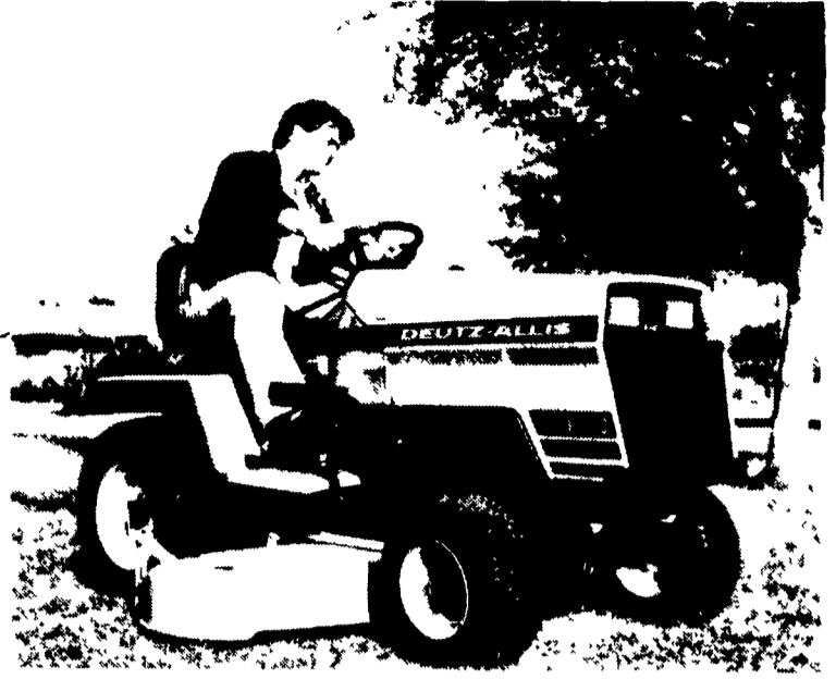
The 1920 "Ultima" garden tractor from Deutz-Allis.

The "Ultima" garden tractors give you compact farm tractor performance at garden tractor prices and are perfect for any job where there's more than just a little yardwork to do.