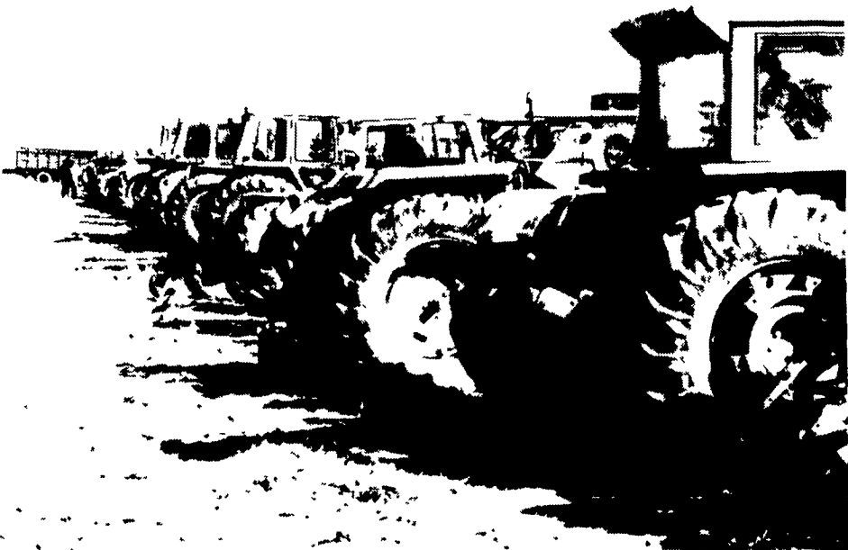
Tractor prices were off slightly, probably reflecting the volume and variety of pieces available.