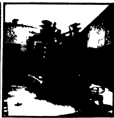
Krause 3121 Landsman