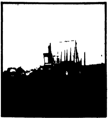
NH 1049 Bale Wagon