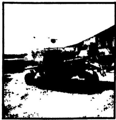
Haybuster 107 No-Till Drill