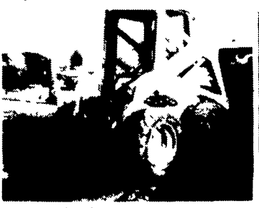
New Holland L445

USED FRONT TRACTOR SUITCASE WEIGHTS For John Deere, IH & Case