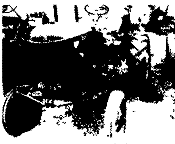
Massey Harris Pony w/Cult