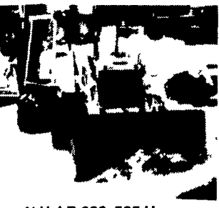
N.H. LB 620, 535 Hrs.

Durvet UTERINE BOLUS Box of 25 List $7.50 SALE $3.95