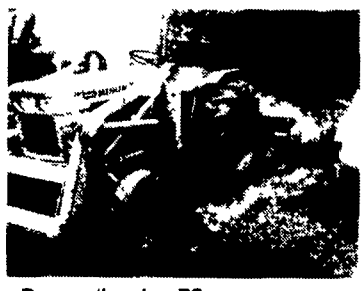
Bison w/Loader, PS