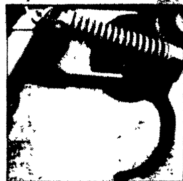
Spring Reset Subsoiler Shanks Are 3"x1½"x36". 20" Trip Height, A 1500 Lb. Point Load And 16" Max. Working Depth.