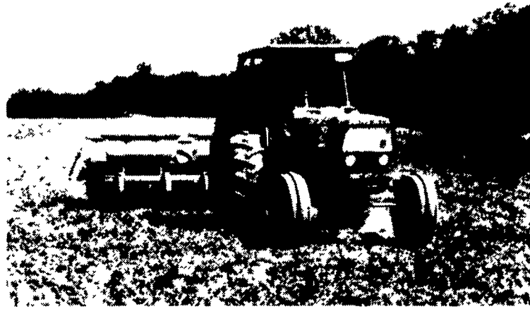
The new Deutz-Allis 6265 produces the punch of larger tractors during planting, but requires less fuel.

"The StarCab and the ROPS platform were designed to give the operator a common-sense work environment that combines safety, comfort, convenience and elbow room. Air conditioning and heating are standard equipment on the cab models," says Kaplan.