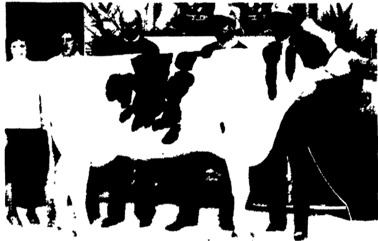
The second highest animal at the convention sale was Golden Circle Pete Magic. She sold for $9,000 to Magic Partners from Tucson, Arizona.