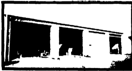
SHOP - STORAGE - GARAGE