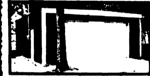
FARMSTEAD® II GARAGE