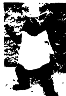
the Z-107 Z-BEAR