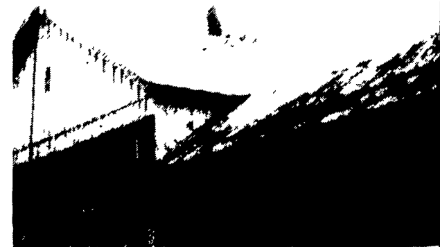
Recent before and after photo from a prominent dairy farm near Easton, Md. We can do the same for you. Repairing flat roofs a specialty.

We Can Rerail - Repair - And Apply Industrial Grade, Especially Made, Aluminum Flaked Protective Coating. Our Coating, Containing Rust Inhibiter, Will Revitalize Your Machinery, Barn, Shop Or Other Roofing Used In Your Business For Only Cents Per Square Foot.