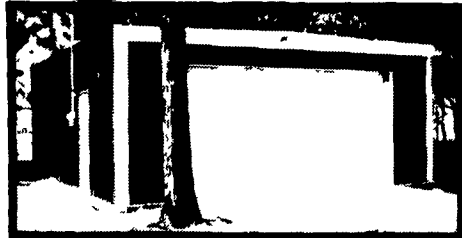
FARMSTEAD® II GARAGE