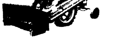
Revolutionary Equalizer is specially-designed to efficiently and easily load semi-solid manure.

a full line of support equipment for your semi-solid and liquid manure handling needs. Basin agitators.