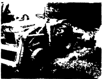
Bison w/Loader, PS $4,800