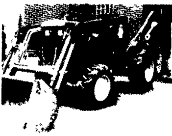
JD 650 4 WDB w/Loader $7,200