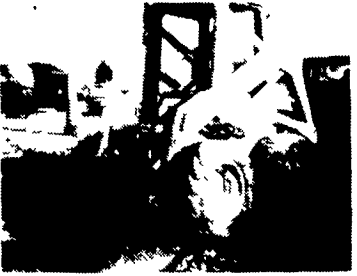
New Holland L445 $7,500

USED FRONT TRACTOR SUITCASE WEIGHTS For John Deere, IH & Case