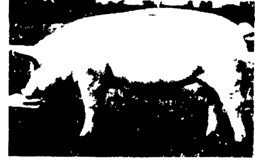
Pennsylvania's Record Selling State Sale Bred Gilt

40 BOARS Seven to Eight Months Old. Durocs by "TRUCK". Four sons Pa. State Test 152D/230#, 2.46 FE, 1.95 ADG, .72 BF, 5.46 Loin, index 113. Sold $544. "ANGLE" 2.7 ADG, 149D/230#, .79 BF, 5.49 Loin, 2.52 FE, Yorkshires by "AWESOME" Ohio test 159D/230#, 1.93 ADG, .66 BF, 5.7 Loin, 2.75 FE "KEYSTONE" $725 - Pa. State Test 2.23 ADG, 151D/230#, 2.59 FE, .79 BF, 5.75 Loin, Index 125. "TOO RUFF" High indexing pen Ohio test $900, 2.51 ADG, 142D/230#, .86 BF, 5.34 Loin, 2.43 FE index 132.