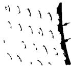
MILK COOLING SURFACE

Featuring: Sunset's pre-formed heavy gauge stainless steel evaporator plate is the heaviest in the industry.