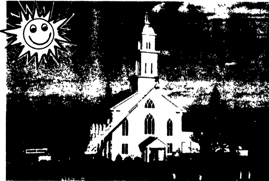
Weisenburg Church, Fogelsville, PA