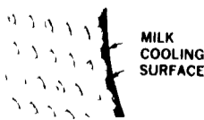
MILK COOLING SURFACE

Featuring: Sunset's pre-formed heavy gauge stainless steel evaporator plate is the heaviest in the industry.