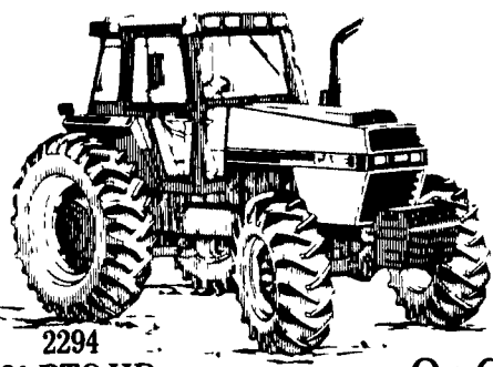
2294 131 PTO HP