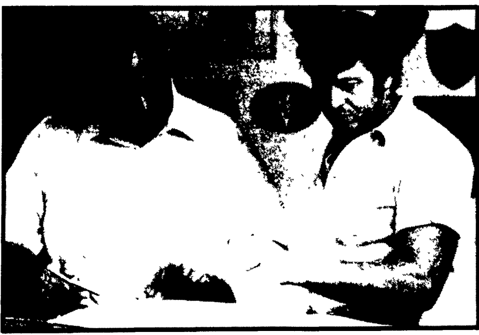
Records showing the true cost to produce 100 lbs. of milk or a bushel of corn are the basis for determining profitability.