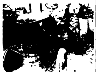
Massey Harris Pony w/Cult