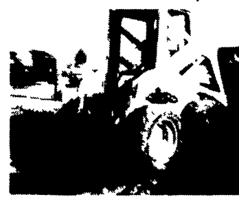
New Holland L445