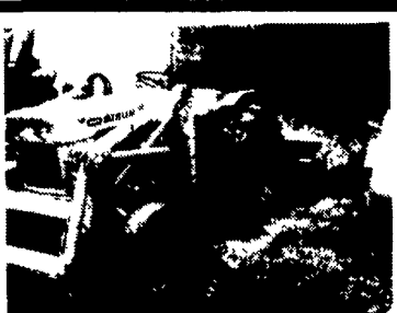
Bison w/Loader, PS