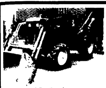
JD 650 4 WDB w/Loader