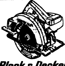
Black & Decker,

USED SKID LOADER TIRES 12.5Lx15 27x10.50x15 10x16.5