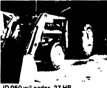
JD 950 w/Loader, 27 HP