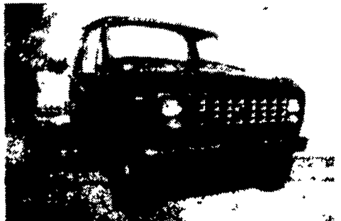
'84 Ford E350 Cab & Chassis, AT, PS, PB, 460 Cu. In., 2 Tanks, 10,250 GVW, Only 69 Miles, Excellent Condition $8,500

MARTIN'S AUTO SALES 725 E. Main St. New Holland, PA 17557 (717) 354-9967