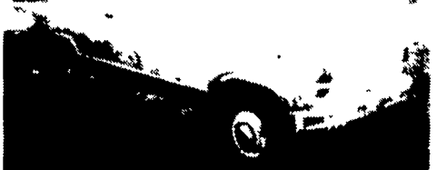
'83 Ford F250 Super Cab, 351, AT, PS, PB, Air, AM/FM Cassette, Reclining Bucket Seats, 2 Tone, Excellent Condition $9,500