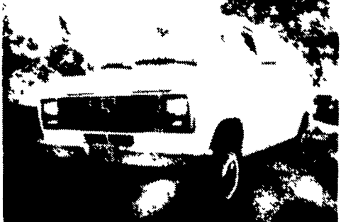
'85 Ford F250 Cargo Van, AT, PS, PB, AM/FM, 6 Cu. 15,000 Mi. $9,250