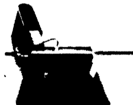
SUNNY PIG 2 2,200 to 4,400 BTU