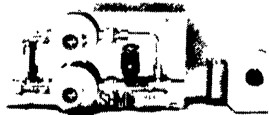
RGG + ST1 SEMI-AUTOMATIC CONTROL w/Thermostat

COMPLETE SYSTEMS, EQUIPMENT, SALES, INSTALLATION, SERVICE FOR CATTLE, HOGS AND POULTRY.