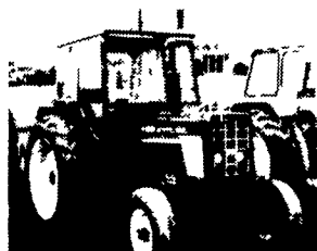
IH 574 Cab, 1975 Nice $5,900 IH 574 Cab, 1977 Nice $6,700