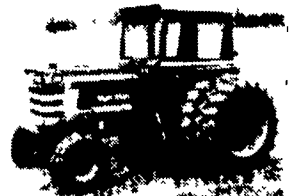
MF 1150 Sharp, Lots of Options, Only 2000 Hours Cheap Power $8,900