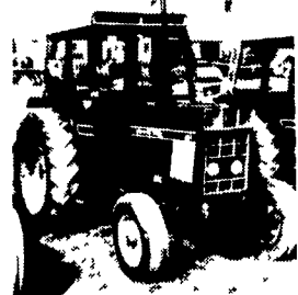
IH 684-1980-2300 Hours TA-Clean $7,900