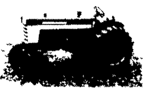
IH 560 Diesels - From $3,500 to $4,500 IH 560 Gas - Narrow Front ONLY $2,400