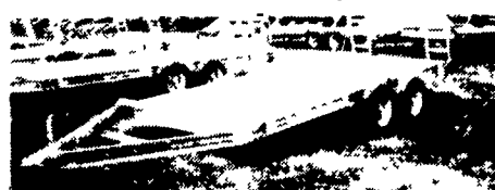
NEW 1985 TRAILERS ON SPECIAL • 2 Axle, 4 Ton, 14 Ft. . . . . $1,595