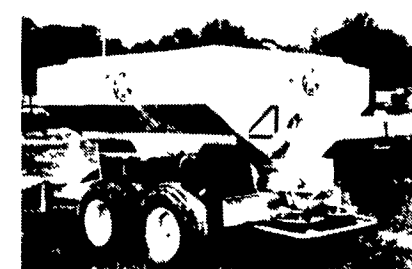
Tandem Axle Fertilizer Spreader ONLY $2,950