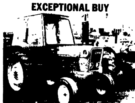
EXCEPTIONAL BUY Ford 6600 - 1977's Choose From 3 With Cabs (2) Have Dual Power CHOICE $6,900