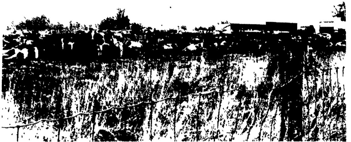
The homebred herd of Mor-Dale Farm rests peacefully in the pasture while awaiting their next milking.