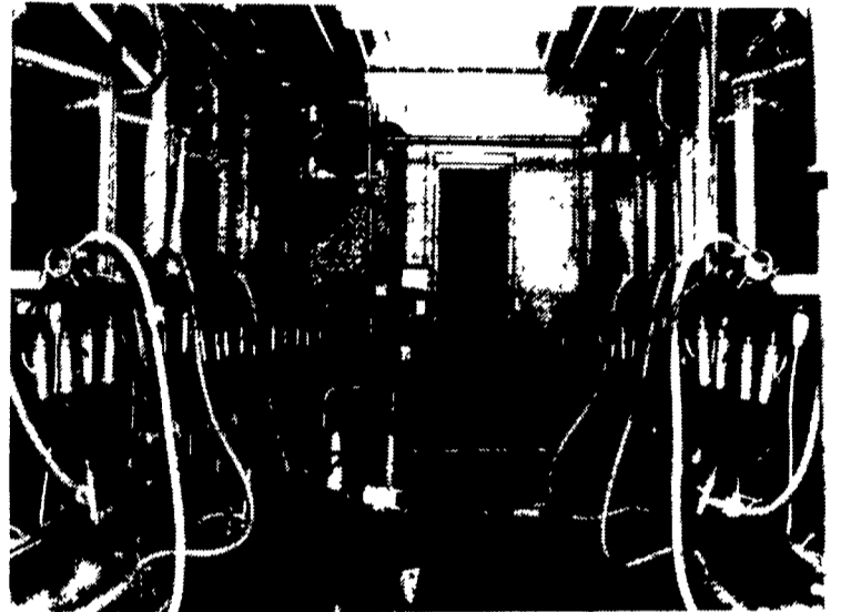
The milking parlor at Mor-Dale Farm is simple, clean, and very comfortable to work in.