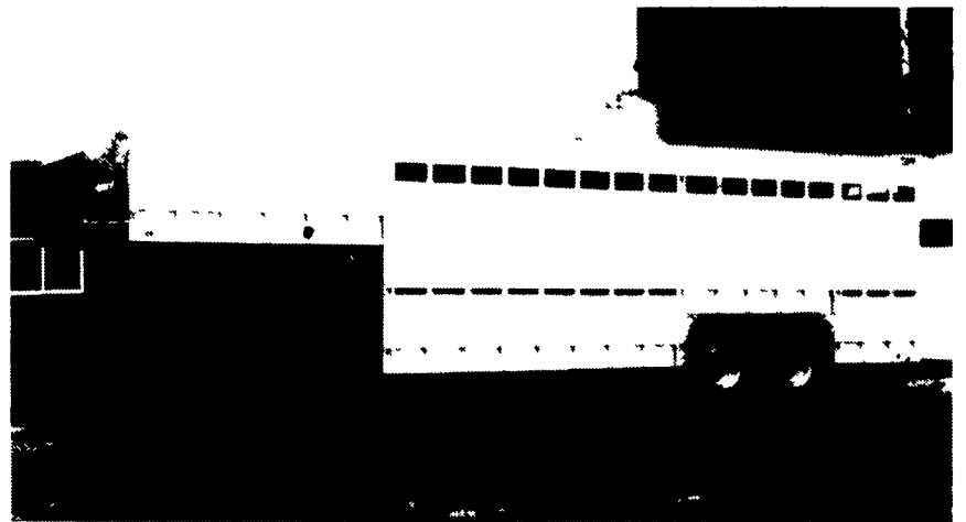
ALUMINUM EBY GOOSENECK TRAILERS

Standard Specifications: LENGTHS AVAILABLE: 8' to 32' WIDTHS: 96" Standard to 102" Optional HEIGHT: 6'6" Standard to 8' Optional